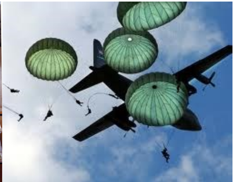
C-130 and Silk, what more can I say