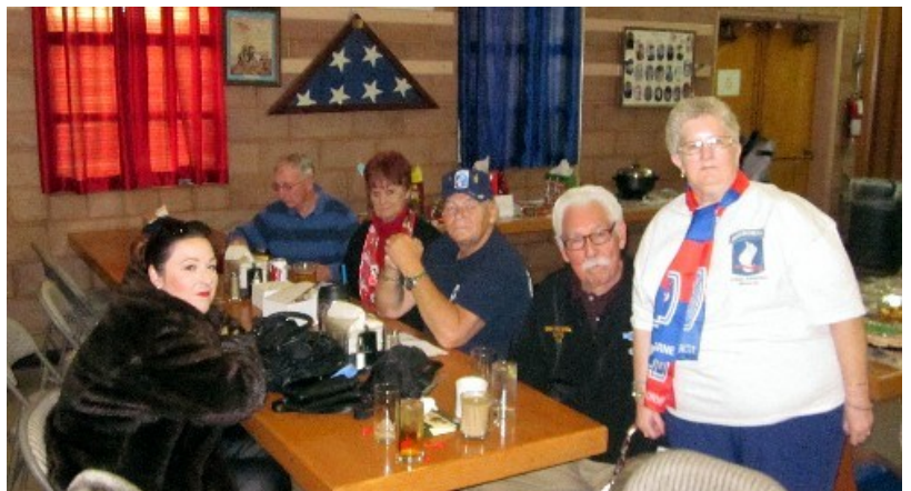
Friends and members at the Christmas party

Happy New Year and Airborne All the Way!